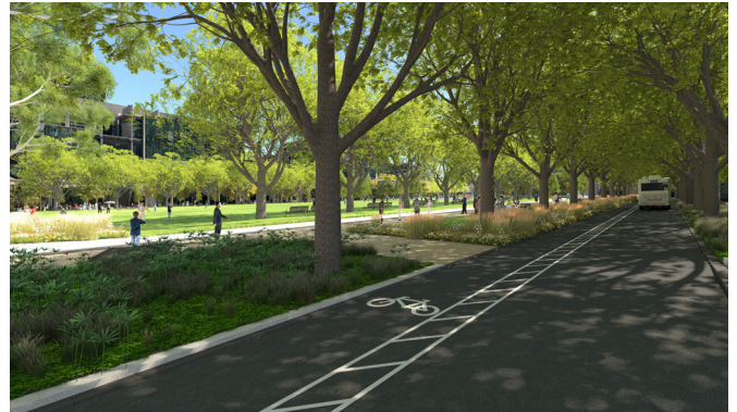
Leicester Street "road within a park"