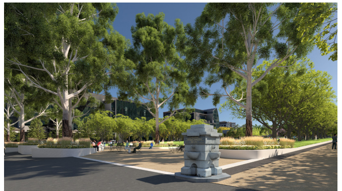
Pelham Street plaza and park entry