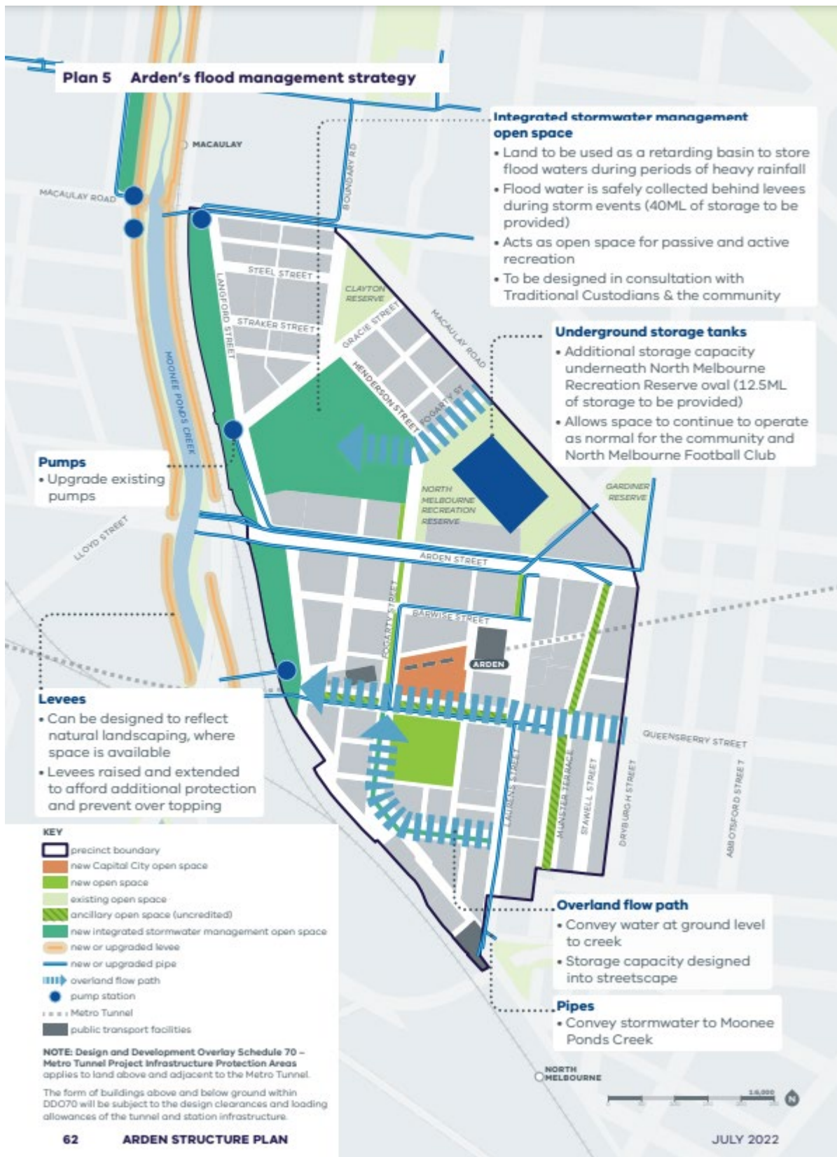
Arden Structure Plan 2022, page 62