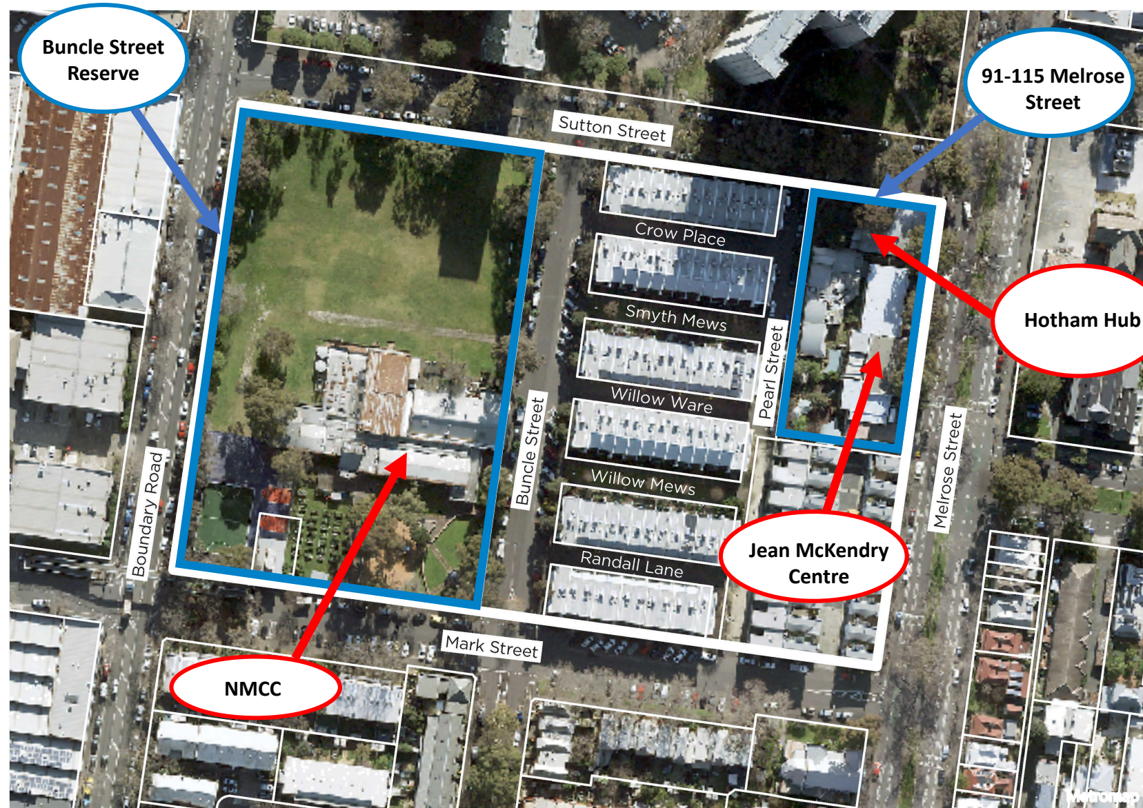
Image: Detailed map of Buncle Street Reserve and 91-115 Melrose Street, North Melbourne

In selecting the new site, consideration was given to how all CoM land in the precinct could be used to meet future population needs and provide increased community and recreation facilities, open green space and affordable housing.