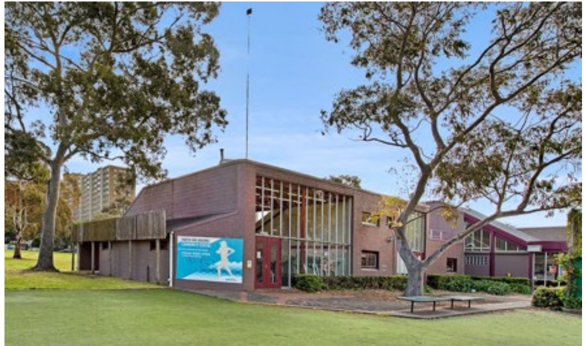
Image: North Melbourne Community Centre (NMCC), 49-53 Buncle Street

The community and service providers in our facilities have consistently expressed the desire for larger and improved facilities to allow for more spaces for community use and enhance the services that make a positive difference to life in North Melbourne.