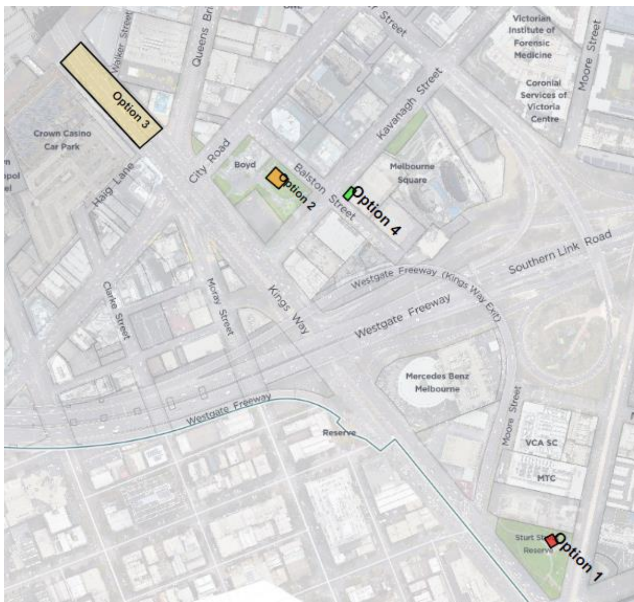
Figure 1: Context map

Options are considered below for a temporary pop up play court until the completion of the Northern Undercroft site. All proposed sites are proposed to include an informal 'play court' with a basketball and netball ring.