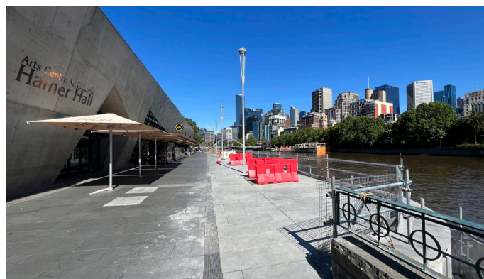
Southbank Promenade upgrade stage one progress

To find out more, please contact 9658 9658 or visit melbourne.vic.gov.au/cityprojects