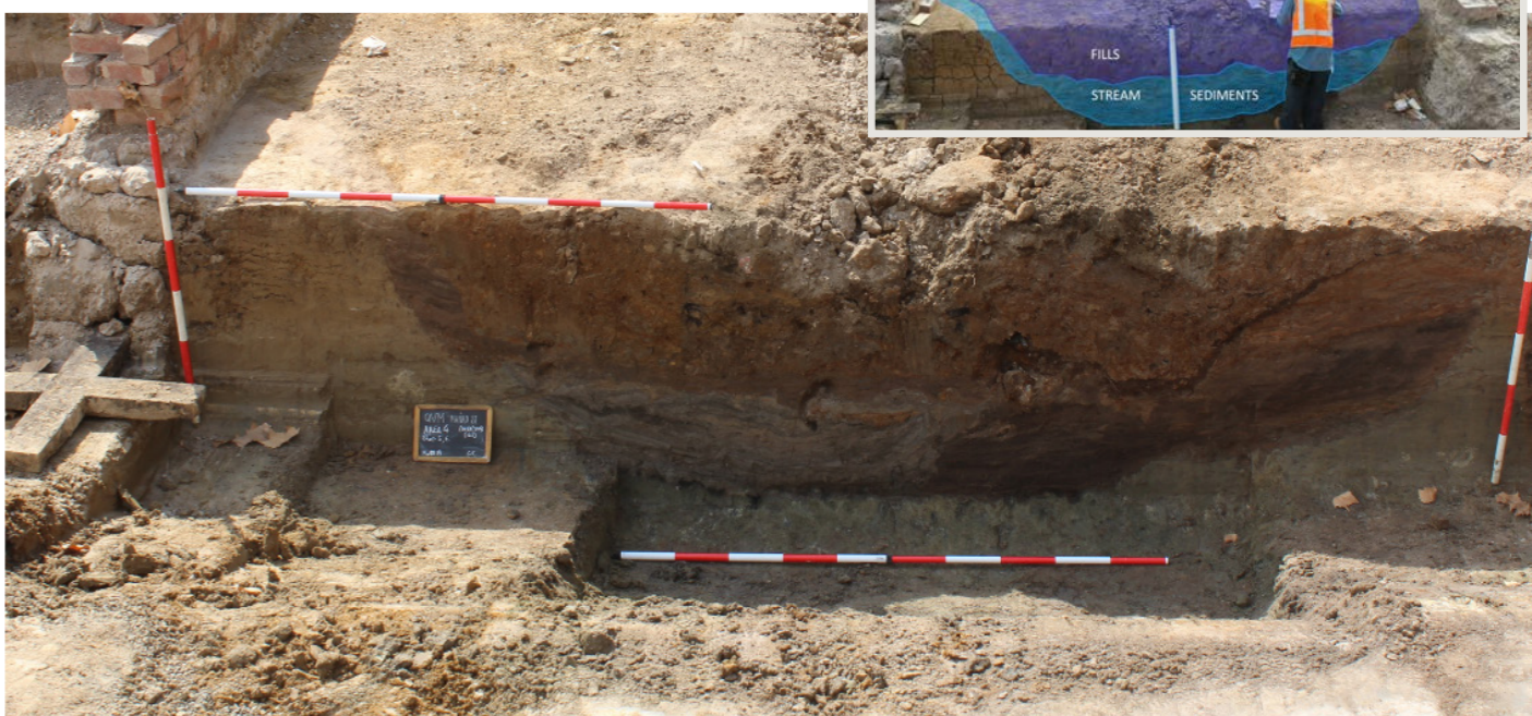
Above: Archaeologists uncovered evidence of a creek line beneath the 1913 Therry Street shops. Believed to be an upper branch of the historic 'Williams Creek', the creek line drained the land from the north west of the Munro site and continued south east another 150 metres toward the current day Elizabeth Street and to the Yarra River. Inset: diagram showing the creekline's location under the Therry Street shops.