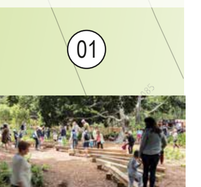
TIMBER BALANCE BEAMS & STANDING LOG MAZE