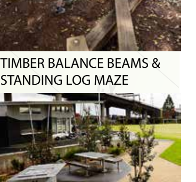
CoM STANDARD PICNIC TABLES AND DOUBLE BBQ AREA