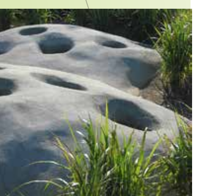
SCULPTED ROCKS FOR FOUND OBJECT PLAY