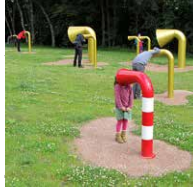
PLAY SPACE SPEAKER TUBES INCORPORATED WITH DECK