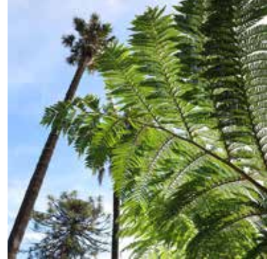
FERNS AND PALM PLANTING TO PATH EDGE