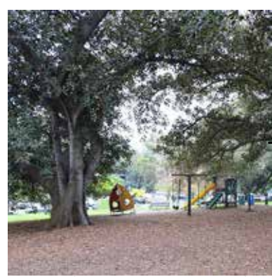
EXISTING PLAYSACE AND MATURE FIG TREES