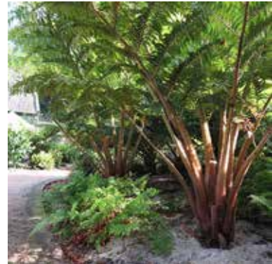
VICTORIAN COOL TEMPERATE RAINFOREST PLANTINGS