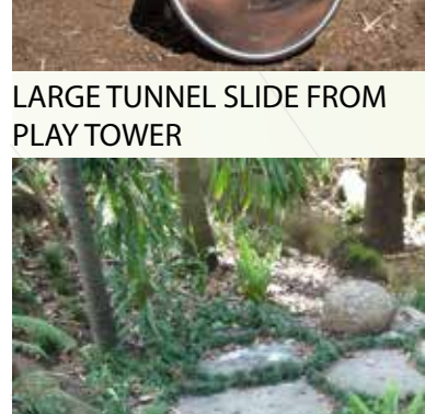
ENCLOSING PLANTING AROUND PLAY SPACE EDGE