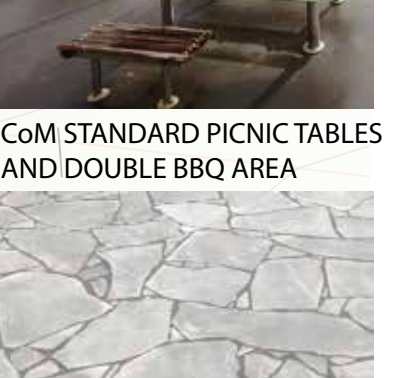
BLUESTONE CRAZY PAVING

PLAYSPACE MATERIAL PALETTE: STAINLESS STEEL (BRUSHED) GALVANISED STEEL (CONCEALED STRUCTURAL COMPONENTS ONLY) CHARCOAL COLOURED POWDER COATED MILD STEEL (EXCLUDING WALKWAY SURFACES) KILN DRIED AUSTRALIAN HARDWOOD 'CLASS 1' (EXCLUDING WALKWAY SURFACES) IMPORTED ROBINIA (SUBJECT TO APPROVED WARRANTIES AND MAINTENANCE PERIODS) POLYESTER CLAD WIRE ROPE FROM APPROVED SUPPLIERS. THE PROPOSED USE OF PLASTIC COMPONENTS IS TO BE AVOIDED AND WILL BE CONSIDERED ONLY WHERE ALTERNATIVE MATERIALS ARE NOT AVAILABLE.