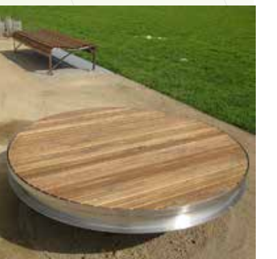
PLATFORM SEATS FOR PLAY & SUPERVISION