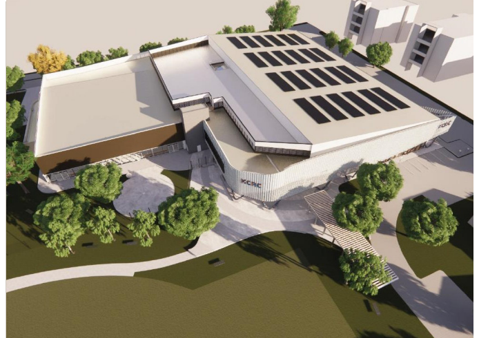
An aerial view of the new centre

Visit our website to see the artist impressions and a video of what the new centre will look like.