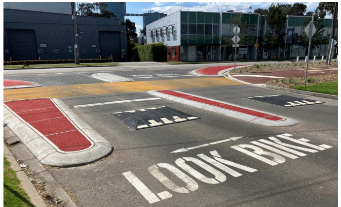
New shared user path and speed cushions

To find out more, scan the QR code below, call 9658 9658 or visit melbourne.vic.gov.au/cityprojects