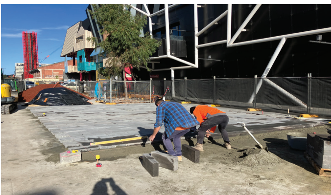
New bluestone pavers

For more information about this project, please call 9658 9658 or visit melbourne.vic.gov.au/cityprojects