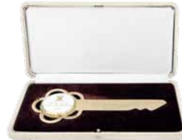
12. Key, City of Bangkok Maker unknown metal, ribbon, 12.5 x 4cm