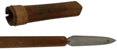
16. Japanese knife, presented on the occasion of the 1956 Melbourne Olympic Games Maker unknown wood, metal, string, 52 x 4.5cm