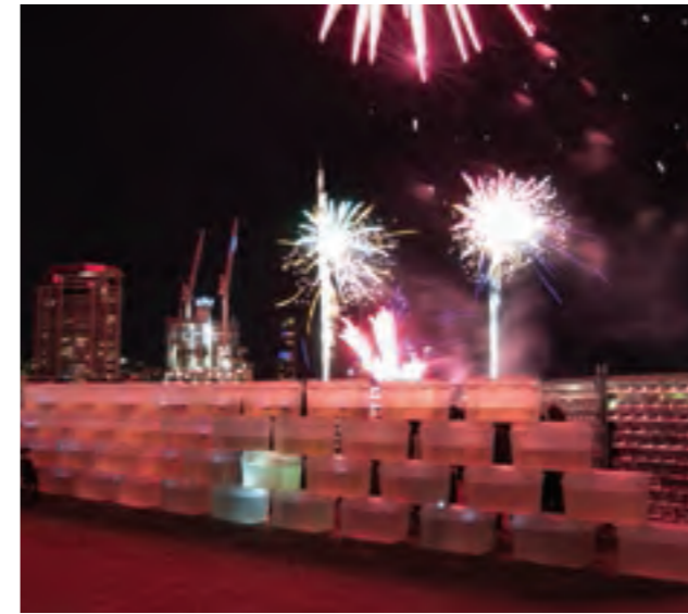
Dirty Buoy installation at 'Urban Realities', September 2011.