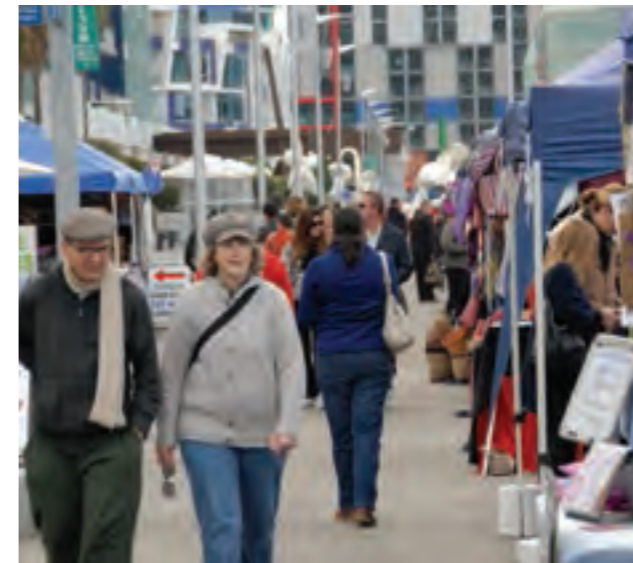
Weekly Sunday market, NewQuay Central.