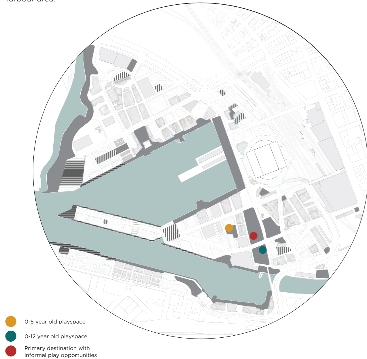
Fig 6.11 Existing play spaces, 2012.

These play spaces are located in the Victoria Harbour area.